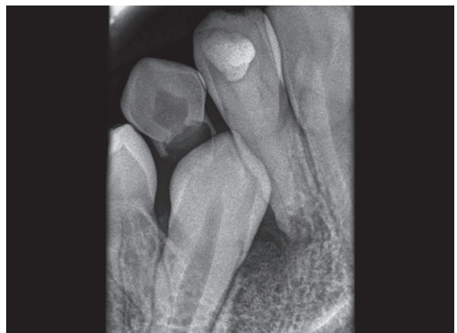
Fig. 5: Postoperative radiograph after follow-up of 3 months showing improved healing in the periapical region