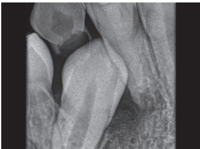
Fig. 4: Postoperative radiograph after apicoectomy was performed and root resection was carried out. Reduction of the apical radiolucency is evident

Biodentine is developed as a permanent dentinal substitute to be used where original dentin is lost. It is available as powder in a capsule and liquid in a pipette. Powder consists of tricalcium silicate and dicalcium silicate which are the principal components of MTA. Liquid for mixing with powder consists of calcium chloride and water-soluble polymer. Marginal sealing ability of calcium silicate-based materials is attributed to its