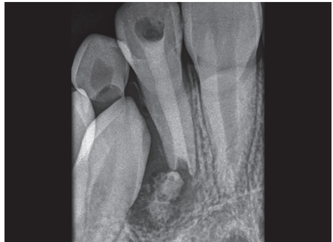
Fig. 3: Root canal completed with Biodentine

After raising a double vertical trapezoidal flap, periapical pathosis and extra Biodentine was removed from periapical area, which was followed by smoothing at root apex and finally sutures were placed. Patient was recalled after 1 week for suture removal and regular follow-up was taken for 3 months, which showed improved healing in radiograph (Figs 4 and 5).