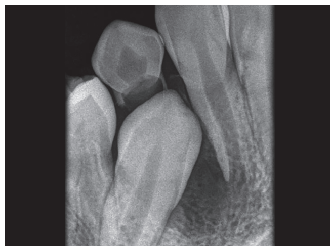
Fig. 1: Preoperative image showing periapical radiolucency in relation to the lateral incisor with open apex

Thus, we decided to go for orthograde filling of root canal with Biodentine followed by enucleation of periapical lesion and smoothening of root apex. Canal was obturated with Biodentine as root canal filling material to achieve a dense seal at apex (Fig. 3).